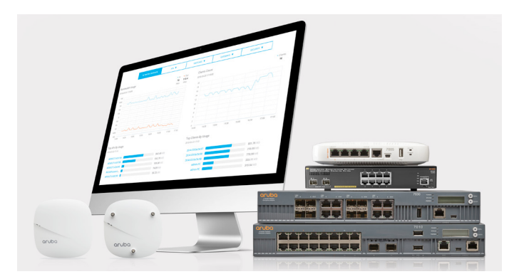
Aruba combines best-in-class wireless and wired infrastructure and management orchestration features with cost saving SD-WAN capabilities.

An Aruba headend gateway or virtual gateway is needed for VPN concentrator (VPNC) termination in hub-and-spoke topologies for IPsec VPN tunnels, and in data center routing scenarios. Aruba Virtual Gateways are deployed in public cloud infrastructures, such as an Amazon Web Services virtual private cloud (AWS VPC) or Microsoft Azure Virtual Network (VNet). These gateways serve as a virtual instance of a headend gateway to enable seamless and secure connectivity for all branch and data center locations connecting to public clouds.