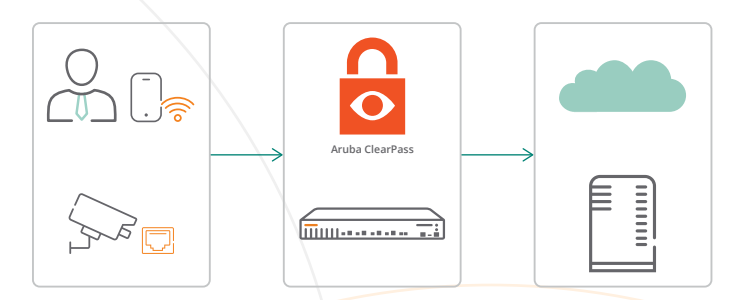
Figure 3: Segment mobile and IoT traffic using Aruba

To simplify and better secure wired and wireless network access, the branch gateway can automatically enforce per-user and per-device roles on wired and wireless networks. Integration with ClearPass Policy Manager allows for centralized role and policy management. This ensures consistent policy regardless of user role and device type, and eliminates the need to configure unnecessary SSIDs, ACLs, VLANs and subnets at every node in the network. For more information on Dynamic Segmentation, please refer to the solution overview.