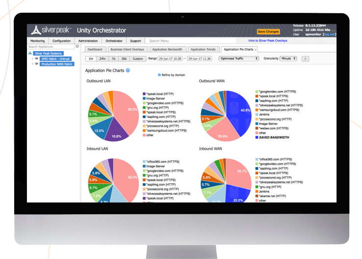
Figure 3: Aruba Orchestrator monitoring report on application consumption.

· Monitoring and reporting tools to generate and schedule multiple customized reports to track a variety of performance metrics; reports may be scheduled on a regular basis and automatically sent to specific individuals or departments