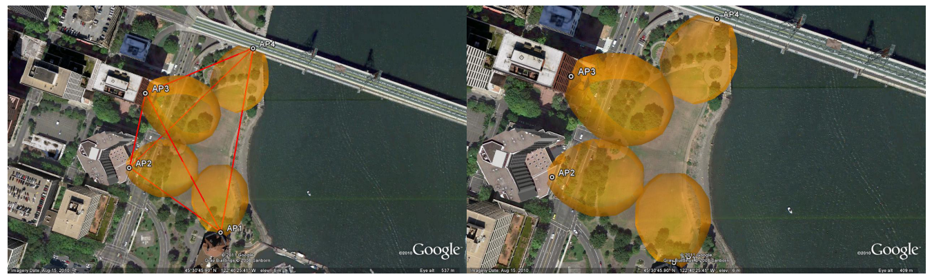
Outdoor RF Planner displays 3D models of the coverage areas by the user-selected 802.11n throughput,

Outdoor RF Planner automatically conducts a series of checks, including verifying each mesh association for valid signal strengths at both ends of the connection, beamwidth alignment, Fresnel zone and earth bulge for long-distance links, and that the associated data rate for the mesh link is above the minimum rate specified.